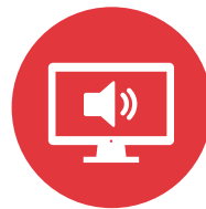
Display and AV Devices