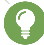
Lighting and Shades

Any room with a SmartDock or Tap is equipped to utilize Extron's powerful AV control capabilities, delivering a turn-key collaboration and control solution that's ideal for any presentation application.