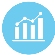
Device Management and Analytics